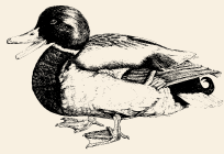
Free Run Duck